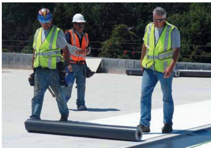
Figure 4. Worker laying out roof roll.

square meters per fastener) and 6.33 square feet per fastener for an 81 inch roll (68.1 square meters per fastener). In comparison, a 10 ft wide (3,048 mm wide) roll, will require side-lap fastening at 6 in. on center increasing the fastener density to 4.79 square feet per fastener (51.6 square meters per fastener). Of course, fastener density will be increased at perimeters and corners to meet the prescriptive increase for higher calculated uplift pressures. While the time to install fasteners and weld seams will vary from job to job, the fastener density will not change, and the welding speed will be somewhat consistent throughout any project providing temperatures remain within a consistent range. The weld temperature window for each type of membrane will also vary but was not a component of this study.