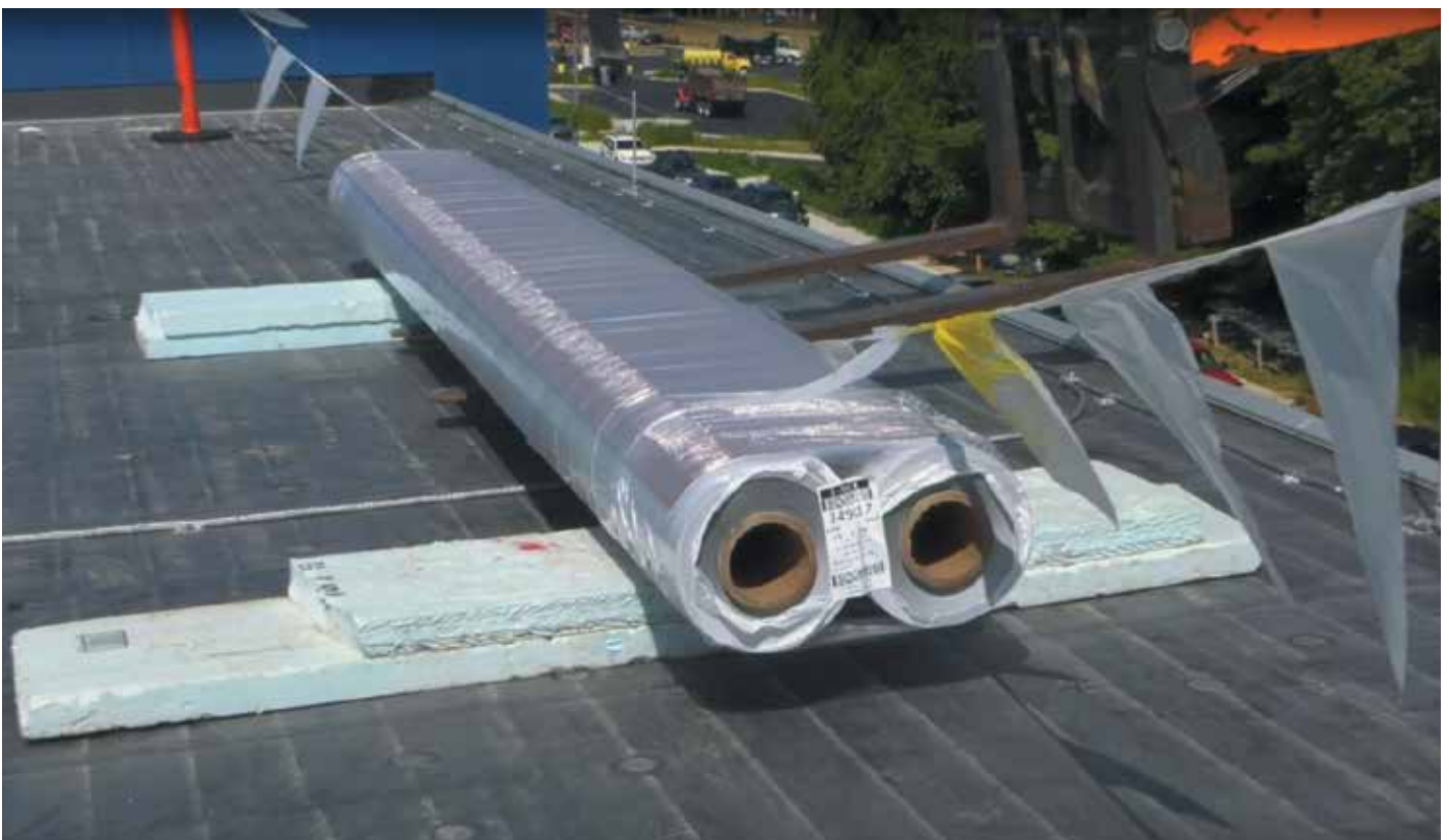
Figure 8. Large-width rolls placed on foam. Manufacturers suggest using insulation dunnage to assist in managing rolls.