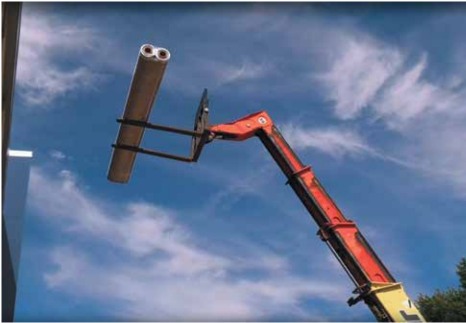
Figure 5. Large-width (16 ft [4.9 m]) rolls being lifted to the roof on a forklift.