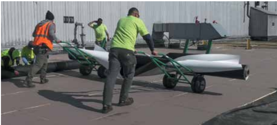
Figure 6. Additional equipment and more workers are needed to move large rolls.

wide assemblies that achieve a 90 psf rating by installing fasteners and lap plates at 12 in. (305 mm) on center. These assemblies are clearly faster than a 72 or 81 in. wide (1,829 or 2,057 mm wide) roll system; however, they are non-standard systems with either unusual deck or fastener types. In all cases, the steel deck is either 80 ksi (552 MPa) and/or the screws are no. 21 diameter (0.325 in. [9.53 mm]), which are substantially larger and more expensive than standard roofing fasteners.