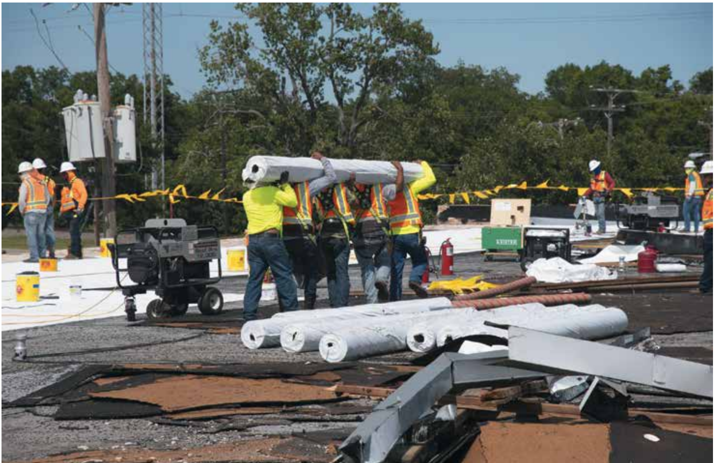
Figure 7. Five workers lifting and transporting a roll weighing over 400 lb (180 kg).